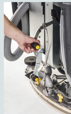
Mechanical scrub and vacuum levers for increased reliability, lower total cost of ownership and increased ease of use.