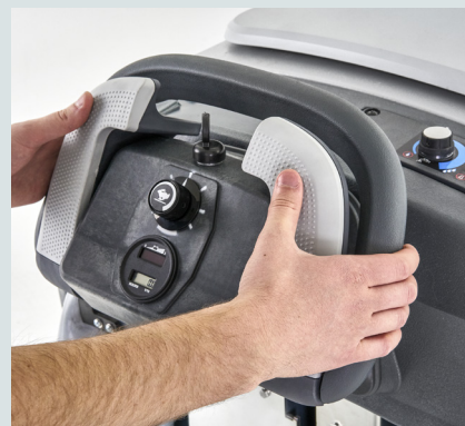
No confusing buttons or switches for a simple and easy to use machine.