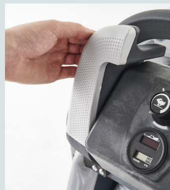
Move paddle backwards to go in reverse, frontwards to go forward; it could not be simpler or safer.