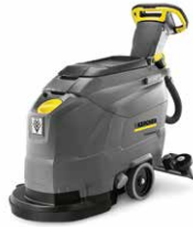
BD 43/25 C BP