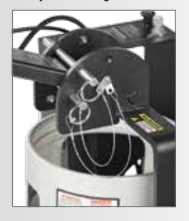
Manual Choke & Electric Start