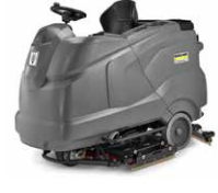
B 200 R BP WITH 2 SIDE BROOMS + R 85