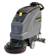
B 40 W WITH D 51 HEAD