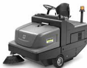
KM 105/180 R BP CLASSIC (WET)