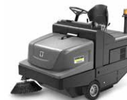
KM 105/180 R BP CLASSIC (AGM)