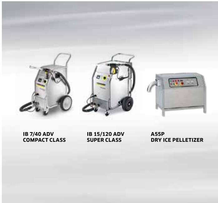
IB 7/40 ADV COMPACT CLASS