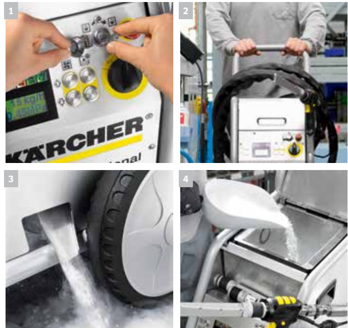
A55P DRY ICE PELLETERIZER