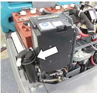
T7, Speed Scrub Rider