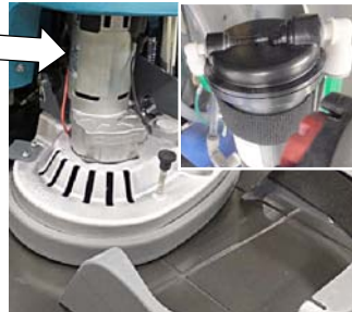
T5, T5e, Speed Scrub